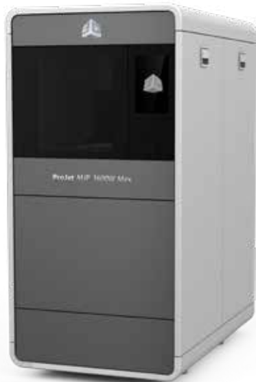
ProJet MJP 3600W Series high-capacity, high throughput precision wax pattern 3D printer