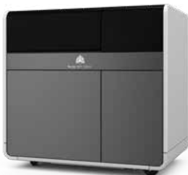
ProJet MJP 2500W fast and affordable precision wax patterns 3D printer

A build area of up to 4.7 times larger than similar class printers allows for broader application coverage and extended unattended operation. ProJet MJP wax printers' high productivity means fast amortization and high return on investment.