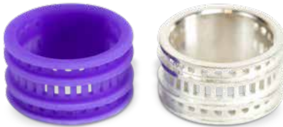
Ring printed in Visijet M2 CAST and cast in silver

Standard Warranty 1 year parts and labor