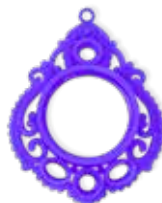
Visijet M3 CAST