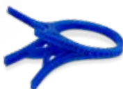
Visijet M3 Hi-Cast

Print sharp edges, extreme crisp details and smooth surfaces with high fidelity. ProJet MJP wax printers are ideal for intricate precision jewelry pieces manufacturing with reduced metal hand polishing.